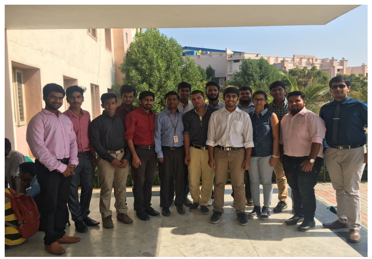
The E - Cell team of Parul Polytechnic Institute participated in E-summit 2017