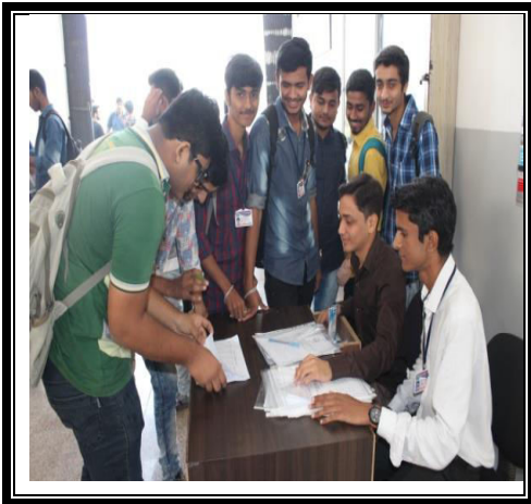
Student registration desk

A one day activity based customized module in the form of workshop titled “ Igniting the Communication Spark ” was organized by the Applied Science and Humanities Department, PSE on Saturday, 4th February 2017 . The workshop covered the verbal, non – verbal and written aspects of effective communication with hands on practice. 246 students registered themselves through the online registration for the participation, where on the first come first serve basis, 90 students got confirmation.