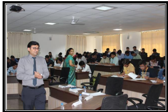
Students performing the task