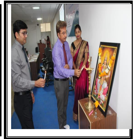
Lamp lightening by the dignitaries