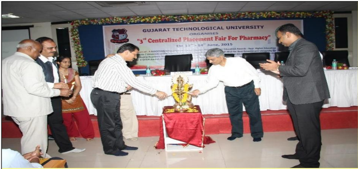
Photo at a Glance of Previous Placement Fair