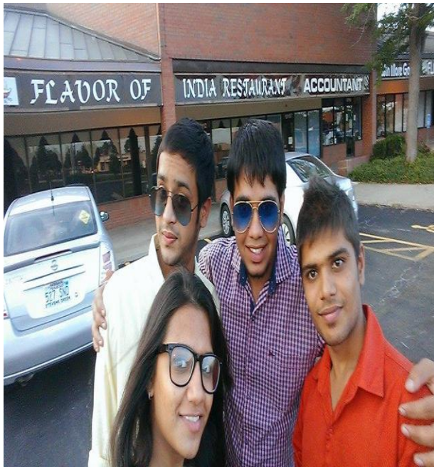
Students Enjoying Indian Food at Kansas City.