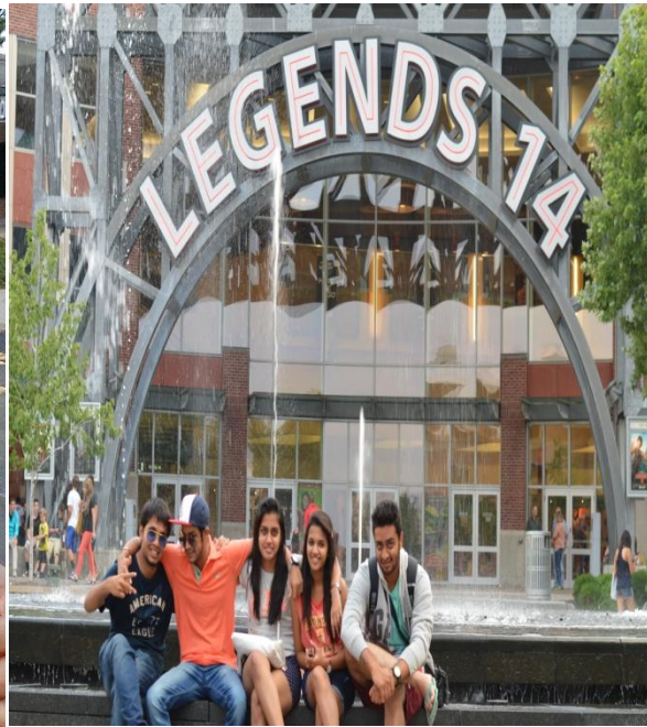
Students Enjoying Shopping at Legend Mall, Kansas.