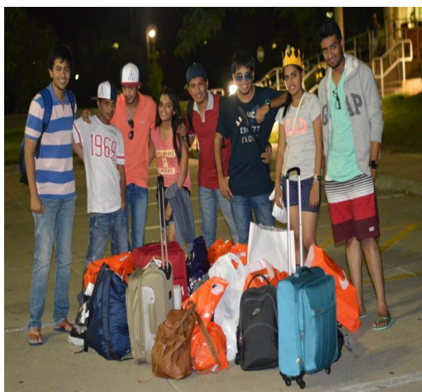
Students outside of Moore Hall