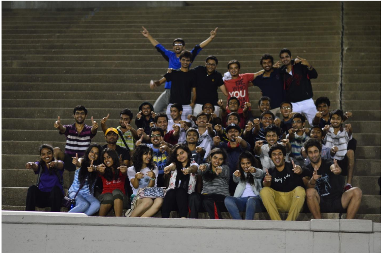
IEP STUDENTS WON THE FINAL MATCH!!