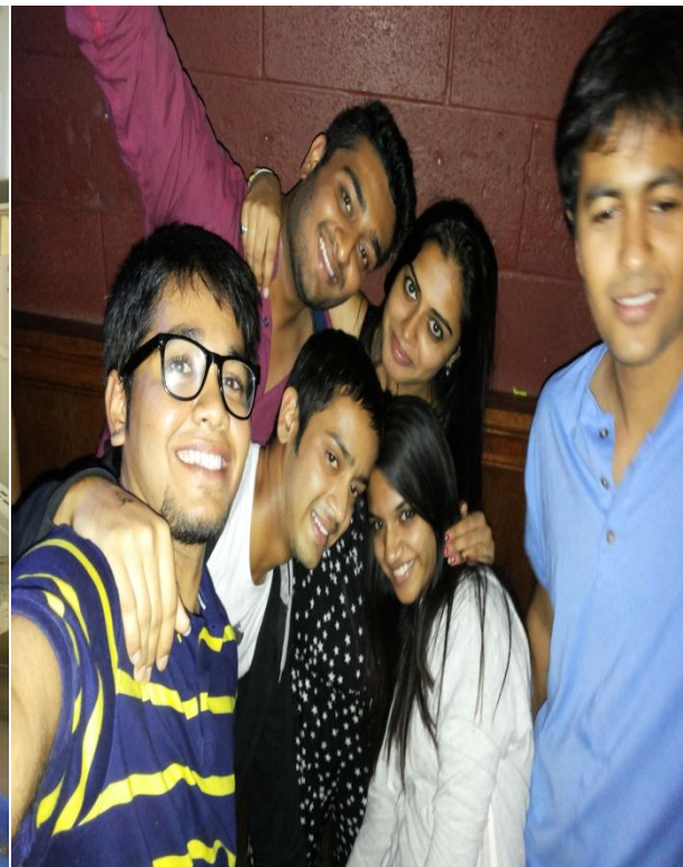
Students Enjoying NightLife at Aggville.