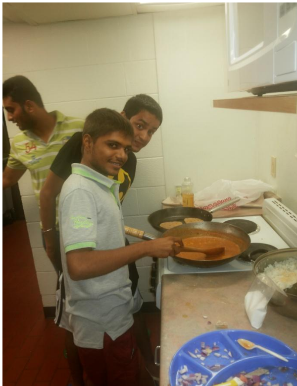
Students Cooking at Residence Hall Basement.