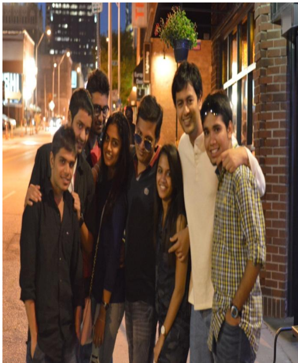
Kansas City Tour by Students

Students are planning to visit city park where they can have a outing experience.