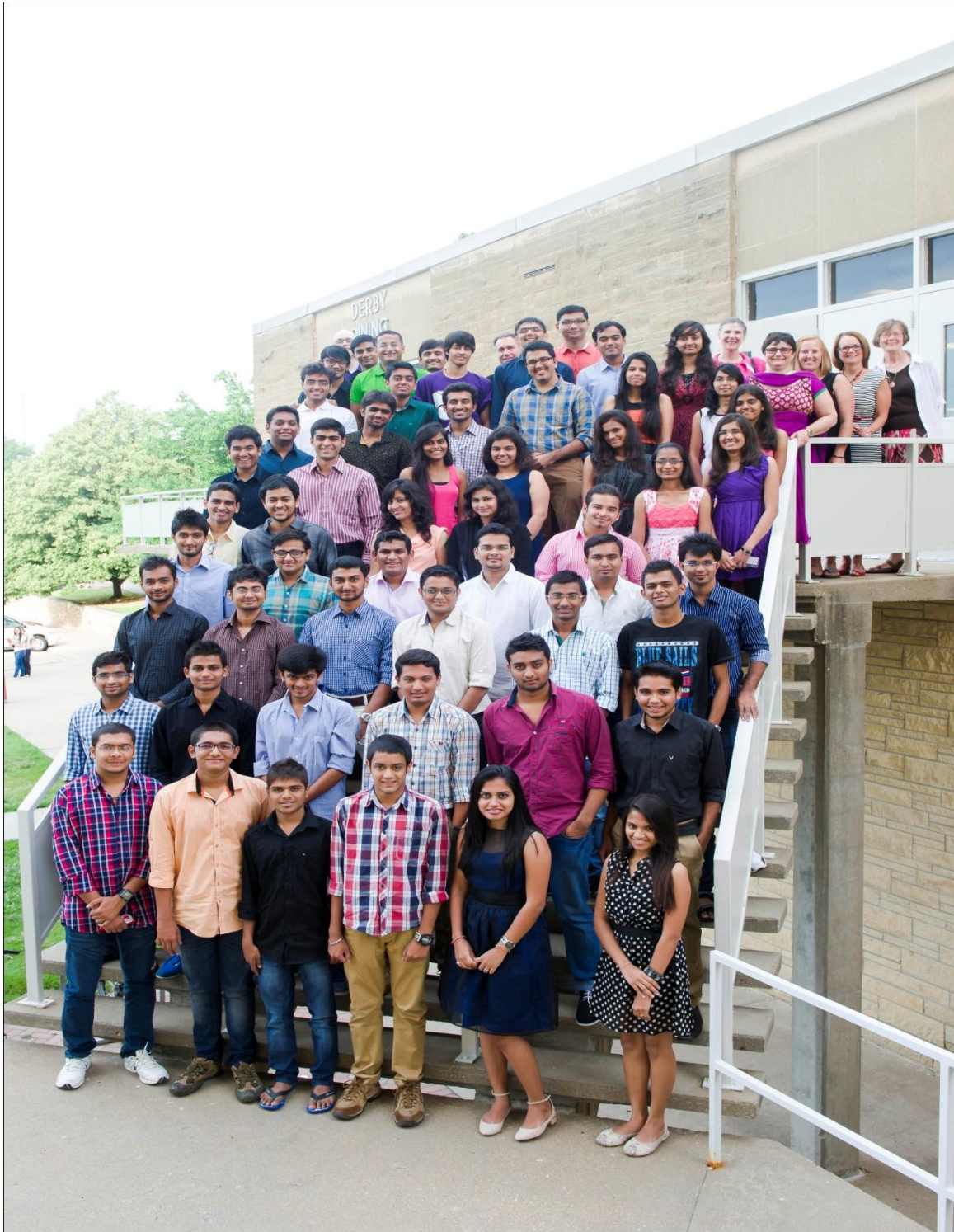
Group Photo After Breakfast on June 25, 2014 at Derby Dining Hall.