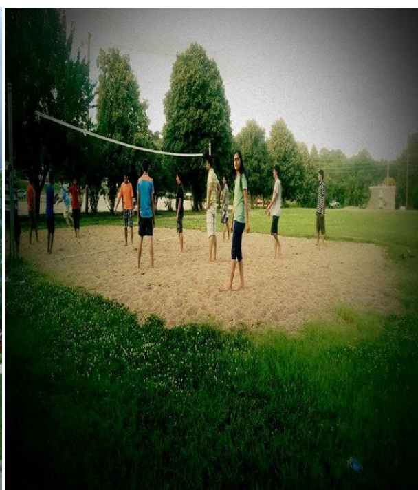
Students Playing Volleyball

Students are getting excellent opportunity to interact with group from South Korea who are also here for similar program with computer science and information department. Students are now tuned for online system of interactions, submission of assignments, online quiz and many more.