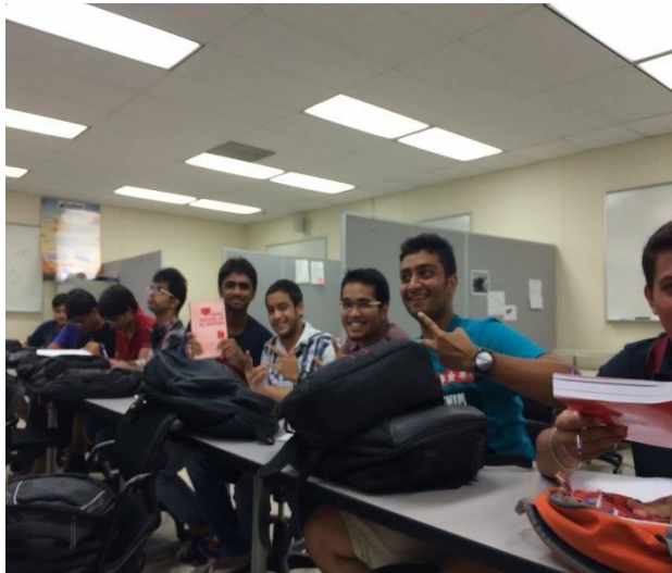
Students in Class!!