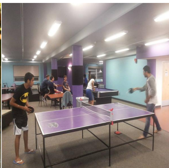
Students Playing Table Tennis & Pool in the Basement