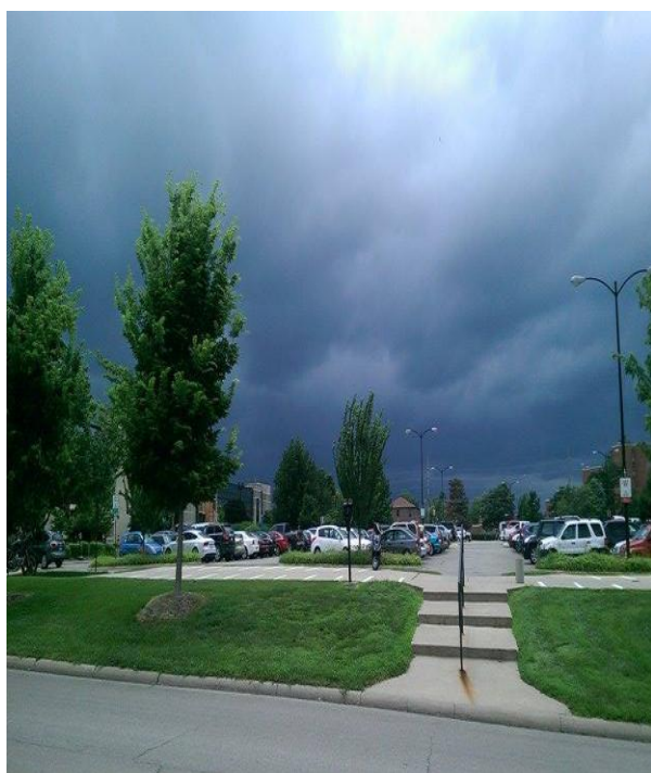
Awesome Weather outside Moore Hall