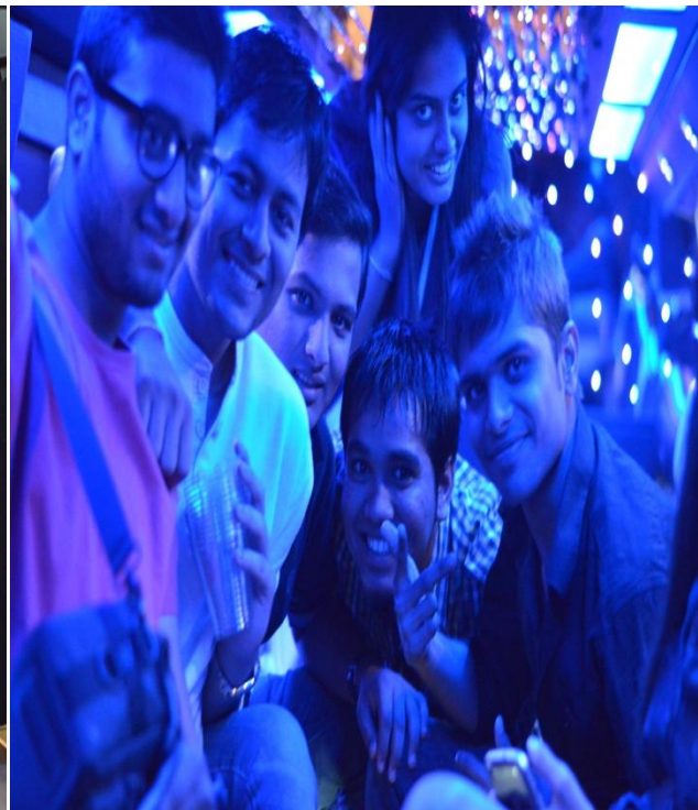
Students Enjoying Limousine Ride