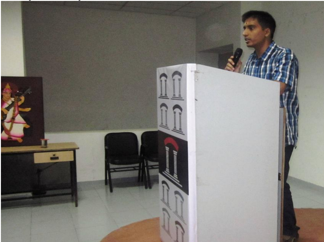
Students share their industrial experience

In-between seminar, few students share their industrial experience with their class-mates. They talk about the work environment and work culture in industry, difficulties they face during training period, newer technology and advanced machinery used in industry now a days etc.