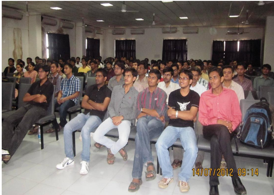
Students attending the seminar seriously