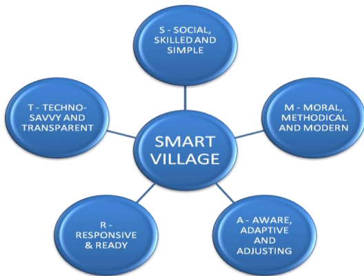
Fig -1 : S.M.A.R.T. Village

role of technology for sustainable development for various achievement of goals for village development.